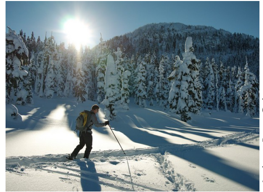
ACC-VI and Strathcona Nordics ski tour to Mount Brooks near Mount Washington

The mission of the FMCBC is to foster and promote self-propelled activities, such as hiking, mountaineering and backcountry skiing in British Columbia through leadership, advocacy and education. By working together with outdoor recreation organizations, industry and government agencies, the FMCBC protects British Columbia's mountains and forests for our future generations to experience.